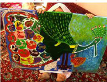
(Film screened at UNAFF 2012)