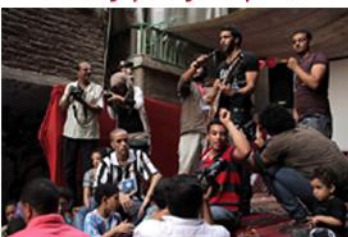
(Film screened at UNAFF 2013)